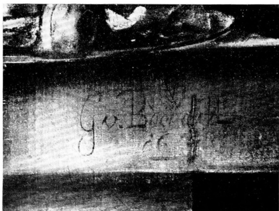
1A. DETAIL WITH SIGNATURE OF Nr. 1.