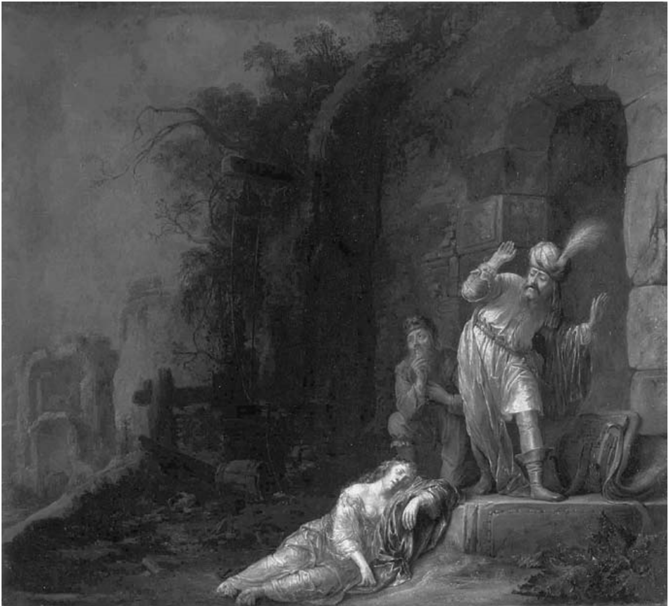
6 Willem Bartsius, Death of the Levite's Concubine , signed and dated 1638, oil on canvas, 100,5 x 110 cm. St Petersburg, The State Hermitage Museum, inv. no. GE-3384.

on all the figures' hands, the Levite's feathered turban and the naturalistic rendering of folded drapery and other kinds of material. As in Abraham Pleading with Sarah on Behalf of Hagar (fig. 2), the scene takes place in front of the door of a house overgrown with dense foliage, but here the painting extends on the left to reveal a view of buildings in ruin. 76