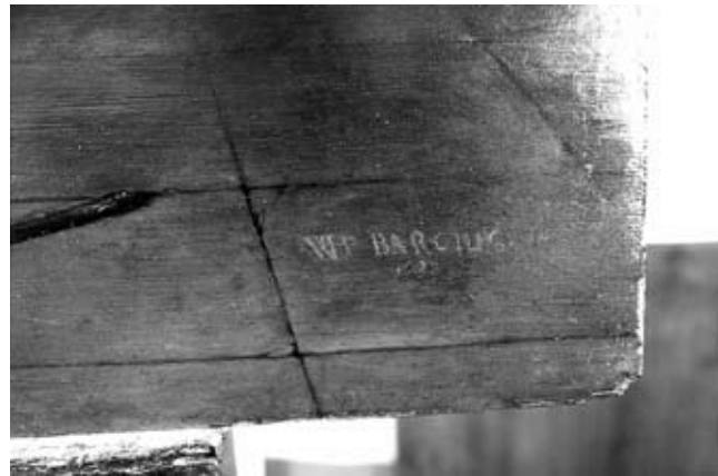
5 Willem Bartsius, Samson and Delilah . Detail of fig. 4 showing the signature.

The main protagonists – Delilah, Samson, the old man cutting Samson’s hair, along with the little boy – are caught in a strong beam of light. This strengthens the theatrical atmosphere created by Delilah who looks at the viewer and raises a finger to call attention to the scene enacted. To maintain this focus, the surrounding shaded areas lack definition with the furthest background figures executed in rudimentary shapes and generally dark tones. The main figures, their costumes as well as the objects of still life are characterised by what Sumowski termed elegant fijnschilderkunst and exquisite colouring. It is not difficult to see why Sumowski considered the painting of Samson and Delilah to be Bartsius’s masterpiece. 61