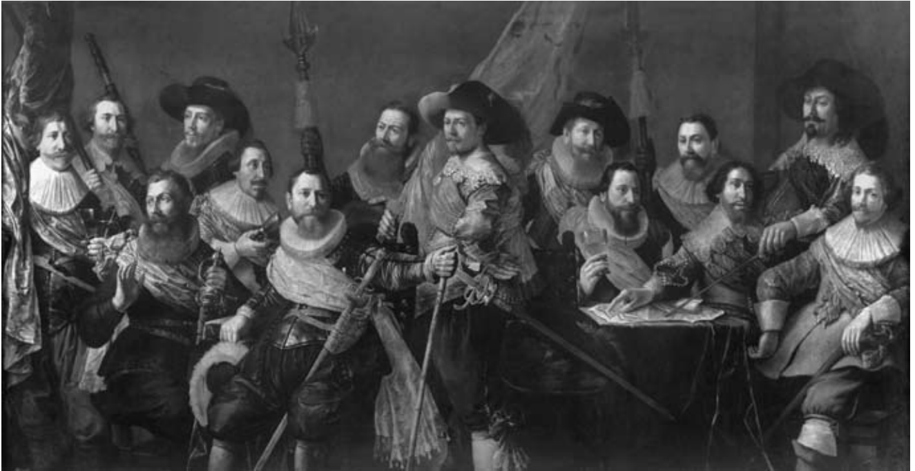
18 Willem Bartsius, Officers and Standard Bearers of the Oude Schutterij of Alkmaar , dated middle right on map: A° 1634, oil on canvas, 198,2 x 385,7 cm. Alkmaar, Stedelijk Museum, inv. no. 20726.

characterisation and attention to detail, several figures are awkwardly proportioned and their heads do not seem to fit comfortably on their bodies. The least successful figure is the man seated to the left of the flag bearer. His head is too large, he has no left shoulder, his left arm is unnaturally twisted and his chest is severely flattened. Despite these compositional and proportional failures, much attention has been spent on meticulous details of clothing and accessories. All the men in the portrait have beards and moustaches and are decked out in their finest black or light brown clothes with red or blue sashes and various types of white collars. 124 Some wear armour and display their sword or hold a wineglass in an elegantly poised hand. Clearly, Bartsius proved himself once again as a master in facial characterisation and textural variation, but only in small individual sections. The fact that he was not particularly successful in putting the pieces together, may be attributed to lack of experience in painting complex compositions or, if he relied on the assistance of his pupil Abraham Meyndertsz, to a lack of co-ordination. Nevertheless his clients were pleased considering the fact that Bartsius received f 225- for the painting and f 90- for the ebony frame which is still in place. 125