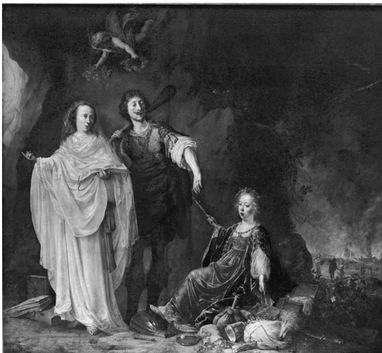
12 Willem Bartsius, The Choice of Hercules, oil on canvas, 156 x 169 cm. Prague, Národní Gallery, inv. no. DO 4276.