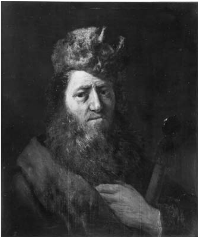
10 Willem Bartsius, St Paul , signed top right: BARTIV F, oil on panel, 69,5 x 59,5 cm. Utrecht, Rijksmuseum Het Catharijneconvent, inv. StCC s 35.

Resembling the format of a portrait but belonging to the field of history painting are the busts of St Paul 91 (fig. 10) and St Peter (fig. 11). 92 St Paul who has a long beard