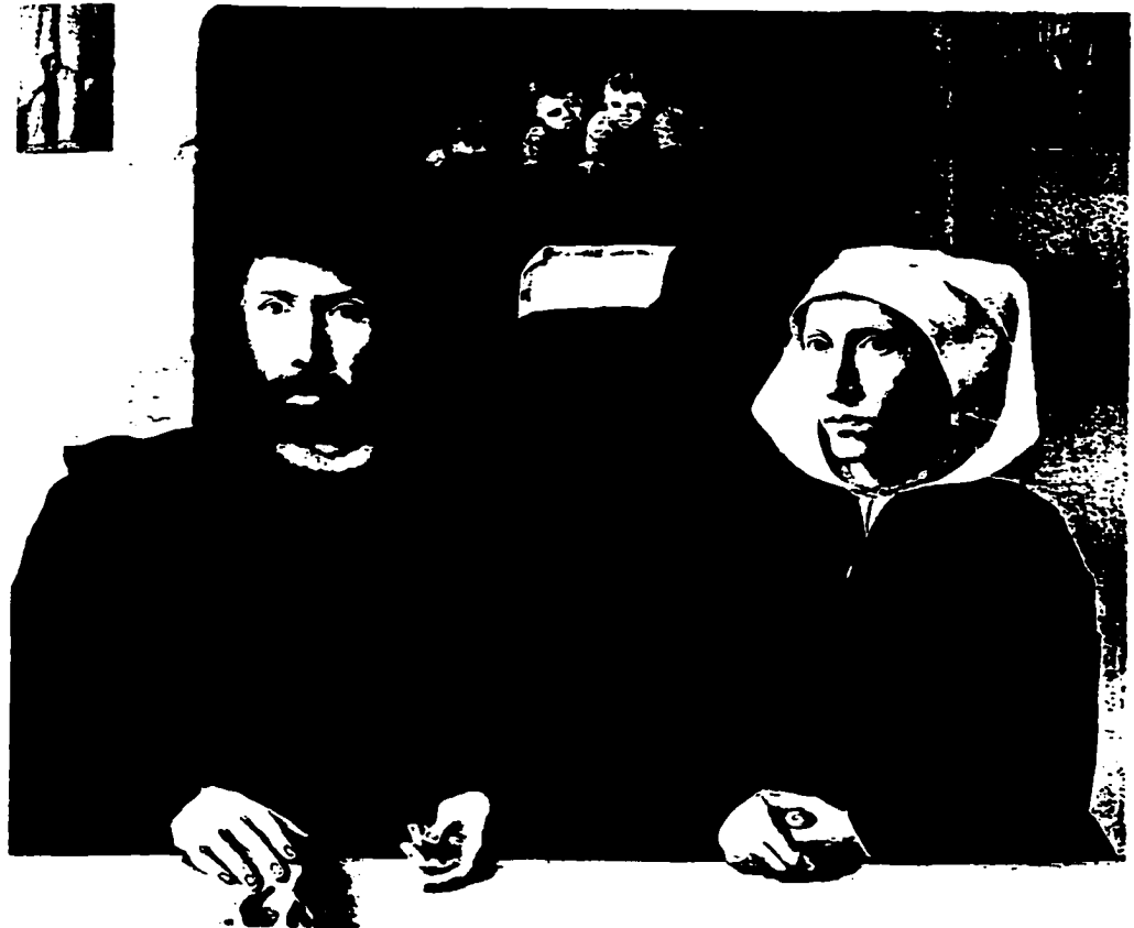
16f. Portrait of the Artist and his Wife ? . Pieter Coecke van Aelst c.1545. Zurich. Kunsthhaus.

Pictor erat nec erat tantum Petre puer Alostum Qui fuit nam Oris natus arte tuam Multa sed accepit mudo ars tui parte laboris Cumque opus pueri adificaret domos Serratus eam. Ita in. Scribit aetnae vultusque Interpres Briga: Francigena quoque aetna