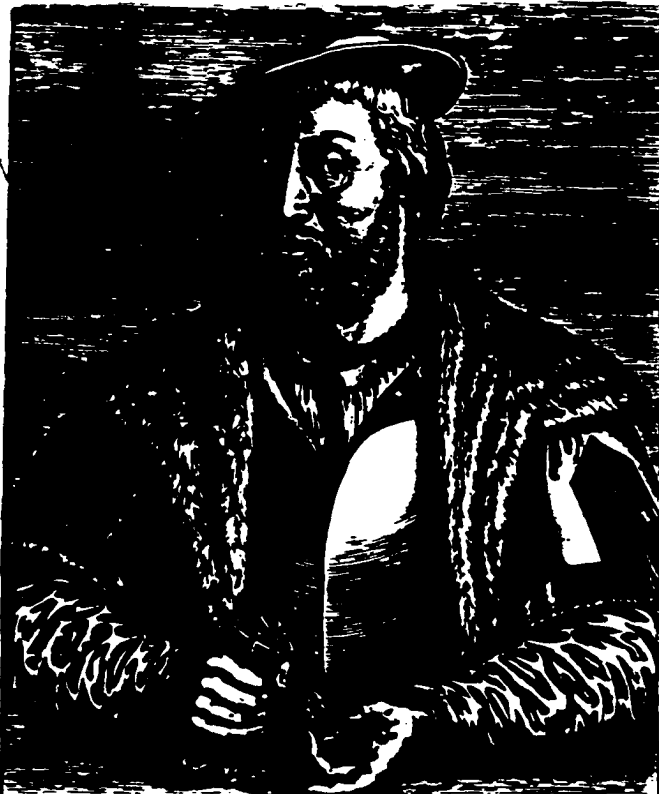
DE IOANNE HOLLANDO, PICTORE.

Propria Belgarum laus est bene pingere rura; Ausoniorum, homines pingere, scire deos. Nec mirum in capite Ausonius, sed Belga cerebrum Non temerè in gnava fertur habere manu. Maluit ergo manus fani bene pingere rura, Quàm caput, aut homines, aut malè scire deos.