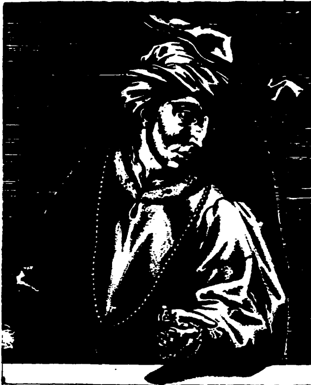
IOANNES AB EYCK PICTOR.

Ille ego, qui letos oleo de semine lini Expresso docui princeps miscere colores, Huberto cum fratre nouum stupuere repertum, Atque ipsi ignosum quondam fortassis Apelli, Florentes opibus Brugæ mox nostra per omnem Diffundi latè probitas non abnuic orbem.