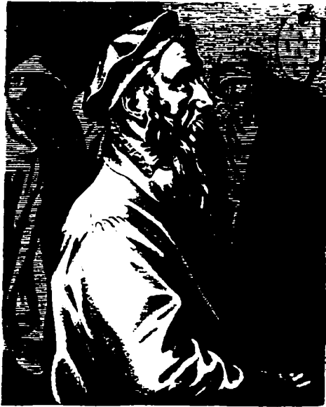
PETRO BRVEGEL PICTORI.

Qui natus in Hieronymi Orti Mate sumpsit Petrus matris claris Belgicis omnino magistris Namque suo estisque magistro Somno pernoctat, illicque Rebus, pariterque rebus Tanta utitur arte peritus In graphis, quos in dia ducunt Ut inquit tamquam in unum Præcipue utitur, et ad omnes in Artem, hanc dicitur invenit