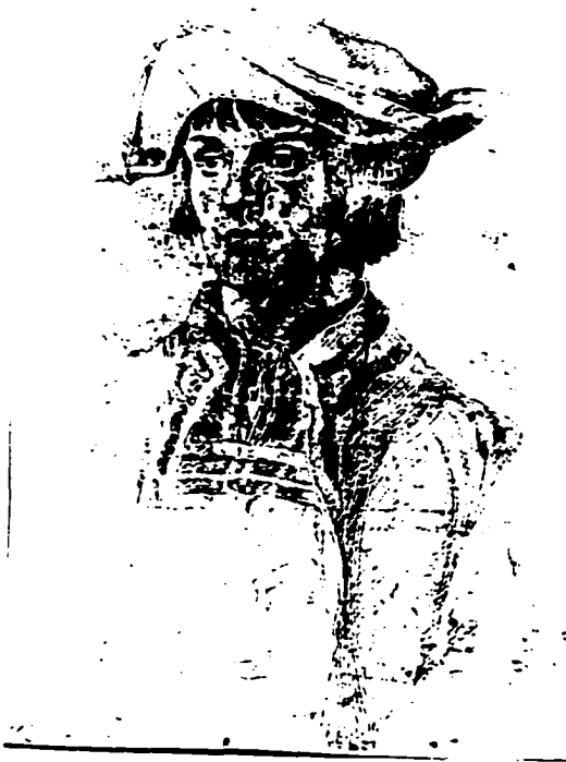
10f. Lucas van Leyden , Albrecht Dürer 1521 [Winkler 816]. Lille, Musée des Beaux-Arts.