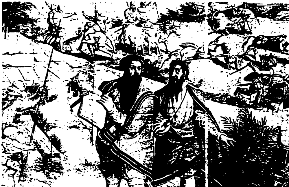
15g. The Sack of Tunis , detail from cartoon for tenth tapestry in Conquest of Tunis series, Jan Cornelis Vermeyen 1546-1548. Vienna. Kunsthistorisches Museum.