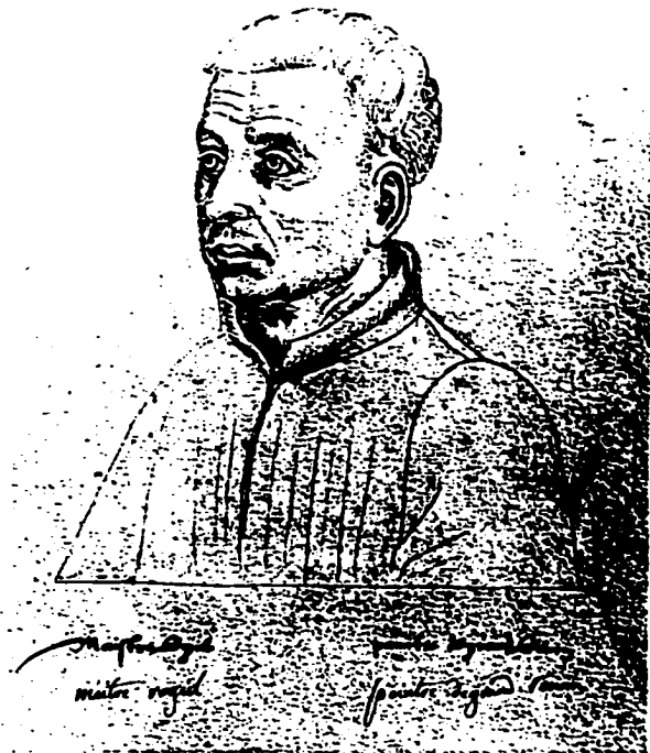
4g. Rogier van der Weyden, from the Recueil d'Arras , anonymous artist, third quarter of the sixteenth century. Arras, Bibliothèque municipale, MS 266.