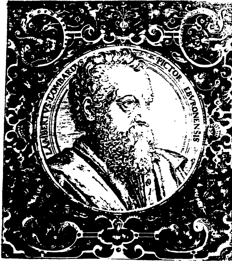
18i. Lambert Lombard , Wierix [after Lambert Suavius]. Berlin.