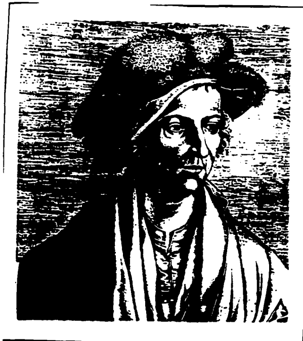
8c. Joachim Patinir , Hondius 1610. Amsterdam, Rijksprentenkabinet, inv. no. 327-I-15.

Haec inter omnes quae unquam Saepe quae tunc Diderit, adhaerens non Ioachim: magis excoluit. Dum rura pagis et alar Expressit, quae rurae in unum, non Omnia in seipsum in patris ipse non Fecit, et quae unquam Curat. Vultus aliam respicit In ora dextra magis alterum sic. Quae gratulatur unum si Curat Quae non comes non amicum. Nam gratulatur illis.