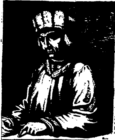
HUBERTO AB EYCK, IOANNIS FRATRI, PICTORI.

Quae modo committas non frater, Hubertus meritis Amicum laudat, aspera Thales tibi. Si non sufficiens addatur et vis tua quod Discipulus frater te superavit opus Hoc viderem ascer vna opus Gandavense Philippum Quae Regem tanto cepit amore sua Eius si ad patrias mandatum occupat terras Conant fieri referit hic manu