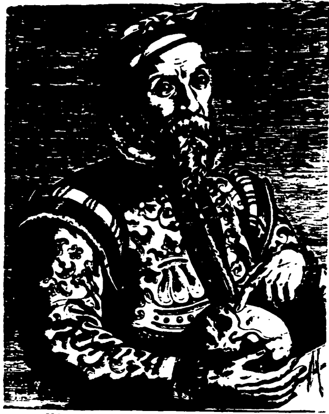
HIERONYMO COCO ANVERPIAN. PICTORI.

Fallor? an effigiem vultus, Hieronyme, primum Hanc duxit pictor post tua fata tui? Nescio quid certe torpens & languidum in illa Non prorsum indoctus innuit hoc oculis. Clarius, beu, sed enim loquitur caluaria cunctis, Indice commonstrat quam tua læua manus: Hi prætere Cocum artifices - quos deinde secutus Vos iisdem comites ille, sibi que vocat.