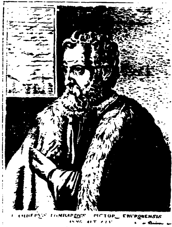
LAMBERTUS LOMBARDO PICTOR. BRUGIENSIS 1580. AET. 71.