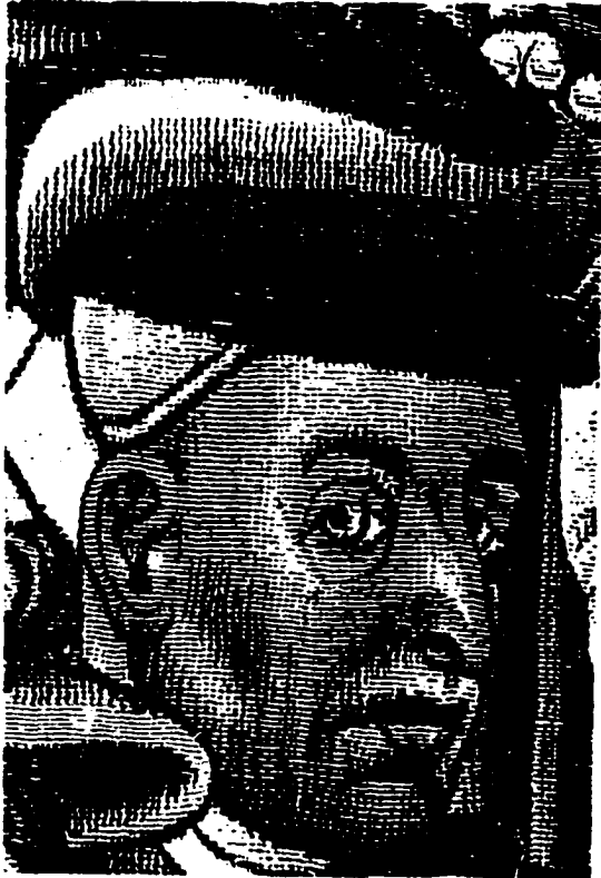
4h. Examples of Justice , detail from the Miracle of the Tongue , after Rogier van der Weyden c. 1450. Berne, Historisches Museum.