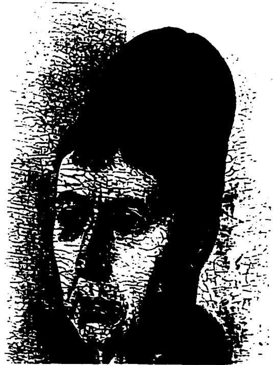
5g. The Last Supper , detail from central panel. Dieric Bouts 1464-1467. Louvain, Church of Saint Peter.