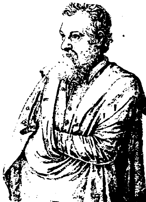
18f. Lambert Lombard [self-portrait?]. Düsseldorf, Kunstmuseum der Stadt.