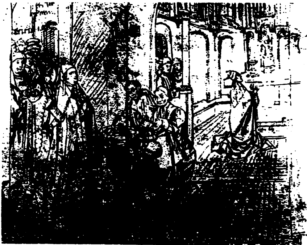
4j. Presentation of Trajan's Skull to the Pope Saint Gregory , attributed to the Cobourg Master of Medallions. Paris, Bibliothèque nationale.