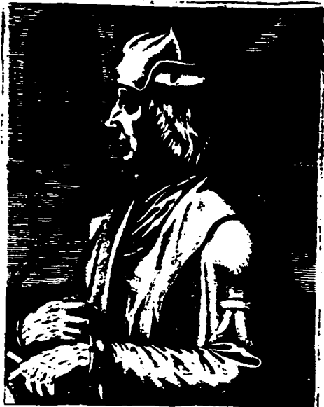
QVINTIVS MESTVS ANVER- PIANVS PICTOR.

Ante fides sacrae Cyclopaus est vbi mecum Ex aequo pistor capis amari prociis Sequitur prociis tudilam tonatoris possitve silent Pencilis obiecti cauta pucis vbi Pistorum me fecit amor tuas vniui silia Cyclopaus: scilicet que nota certa me Si vbi vbi nati vniui vniui vniui Pistorum: i. sacra summe Pucis silia