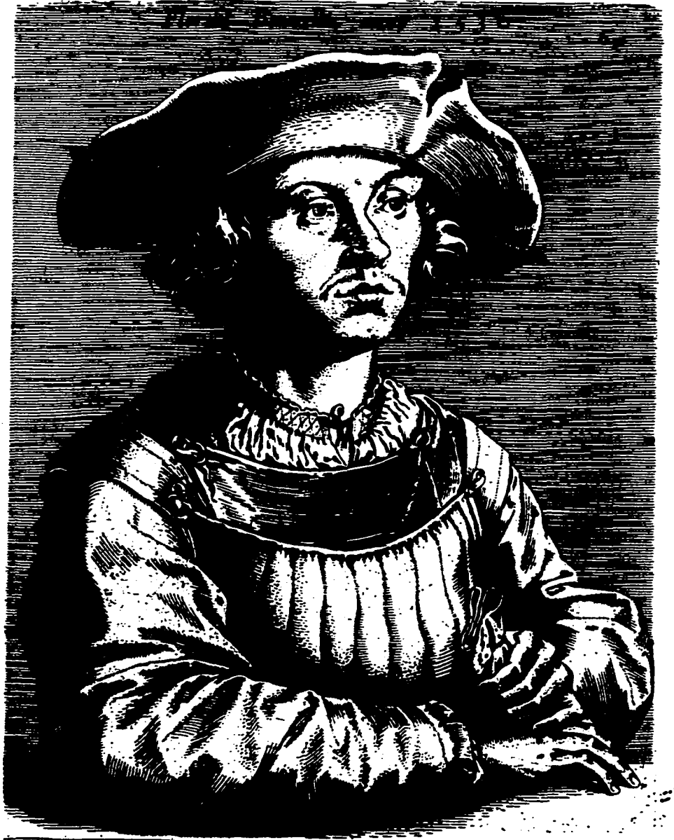
BERN. ORLEIO, BRUXELLENSI PICTORI .

Aulica quod sese Bernardo iacet alumno Bruxella, Attalicas doctissima pingere vestes; Non tam pictoris, si quis me iudice certet, Artsi debetur, quanquam debetur & arti; Quam tibi quod carus, Belgarum Margari reatrix, Dum tibi Apellea nihil est iucundius arte, Aurea peniculis te dante manubria, & aureos Sape tuit, cufum paulo ante numisma, Philyppos. To. Gale. read.