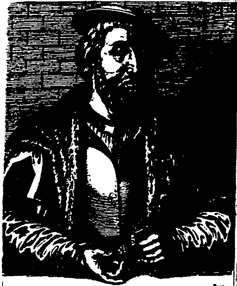
DE IOANNE HOLLANDO ANVERSIANO PICT:

Propria Belgarum laus est bene passere cura Anonimorum homines passere sua deos Nec morum in capite Anonimorum sed Belgis coriorum Non temere in quibus fertur habere manum Manus ergo manus sunt bene passere cura Quam caput aut homines aut malis sunt acies