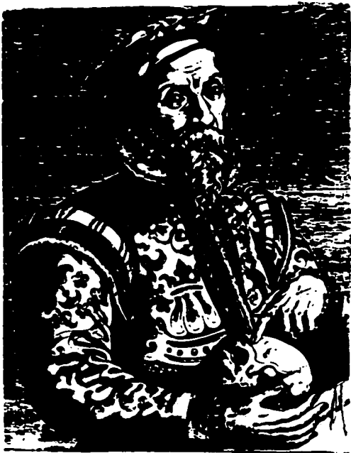
23. [detail] Hieronymus Cock 1572.