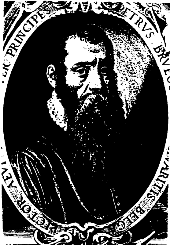
19f. Pieter Bruegel II?, Aegidius Sadeler II [after lost drawing by Bartholomeus Spranger].