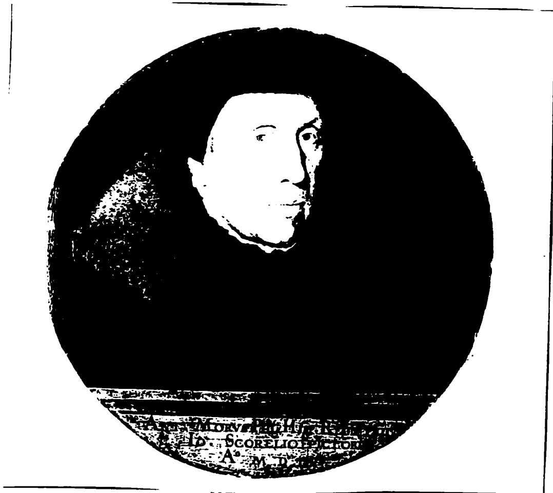
17g. Jan van Scorel, Antonio Moro 1560. London, Society of Antiquaries.