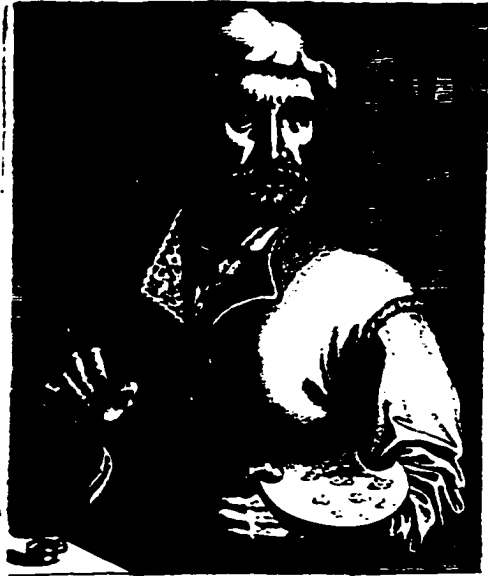
16c. Pieter Coecke van Aelst . Hondius 1610. Amsterdam. Rijksprentenkabinet. inv. no. 327-I-15.