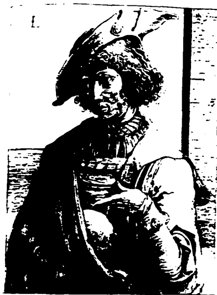
LVCAE LEIDANO PICTORI, ET SCULPTORI

Tu quoque Duxeris non per, sed prope, Lucas, Sua tabulae pingis, seu formae sculpsit abenas. Et Typo reddentes omnes miranda papyro, Haud minus in parietibus tua est, ea gloria, vestro Accede, et tecum nasci Leida. Canone.