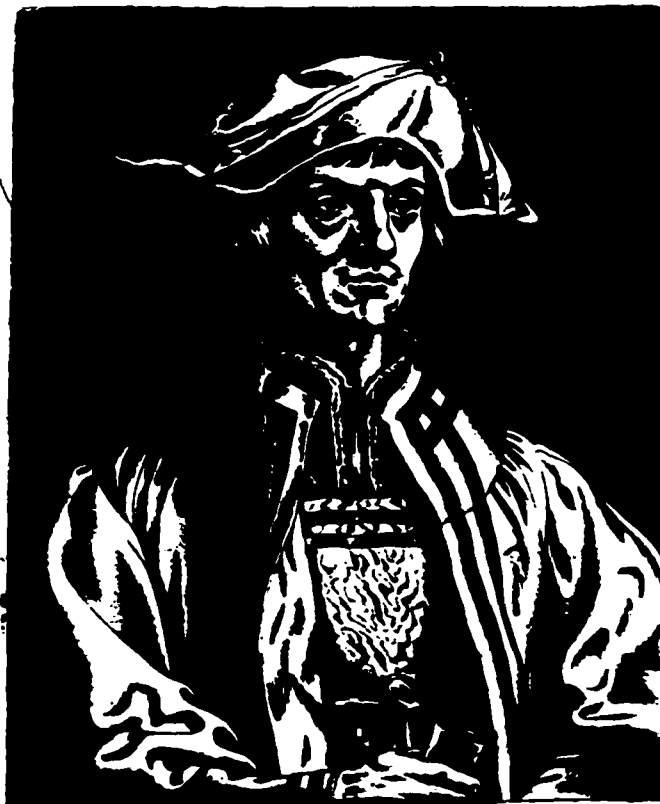
LVCAE LEIDANO PICTORI.

Tu quoque Duxero non par, sed proxime, Luca, Seu tabulas pinguis, seu formas sculpis abenas, Egypa reddentes tenui miranda papyro, Haud minimam in partem (si qua est ea gloria) nostrae Accede, & tecum natalis Leidae, Camena.