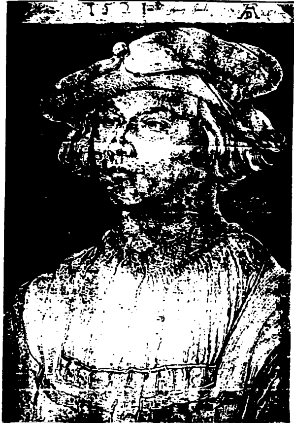
6i. Portrait of a Man , Albrecht Dürer 1521 [Winkler 810]. Paris, Louvre.