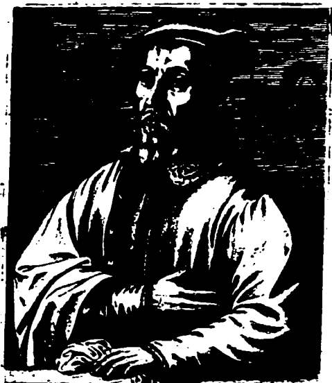
MATTHIÆ COCO ANVERPIAN PICTORI. HIERONYMI FRATRI.

In quoque Mattheia sic pingere rura sicca Vt tibi vix decerunt tempora nostra parum Ergo quod artifices videri sperant et ipsi Quos immortale Regna iuuat omnes Non in te pietas tantum fraterna, sed arti Efficit et merito iam prouidentia tua