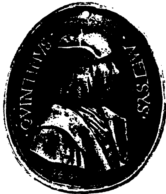
9g. Quentin Metsys , 1495. Brussels. Cabinet des Médailles.