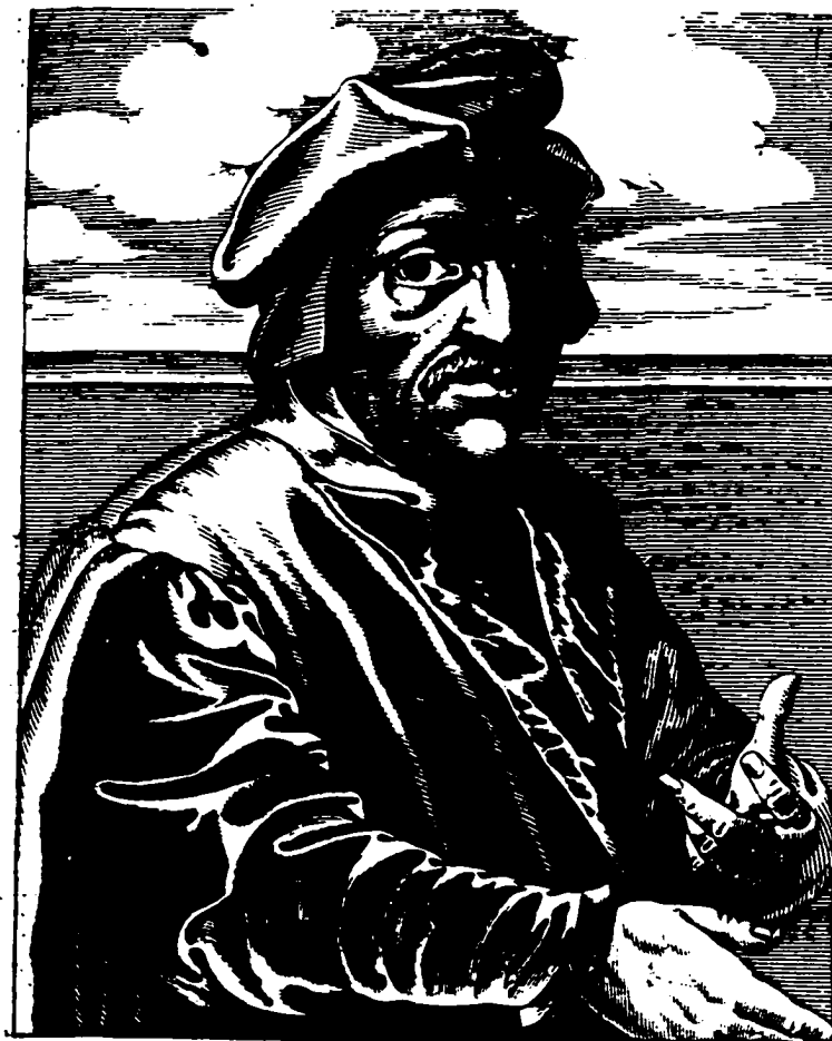
ANDREA, DEL, SARTO, PIT, De. Larmessin fecit.