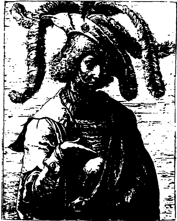
10g. Young Man with a Skull , Lucas van Leyden 1521. Amsterdam, Rijksprentenkabinet.