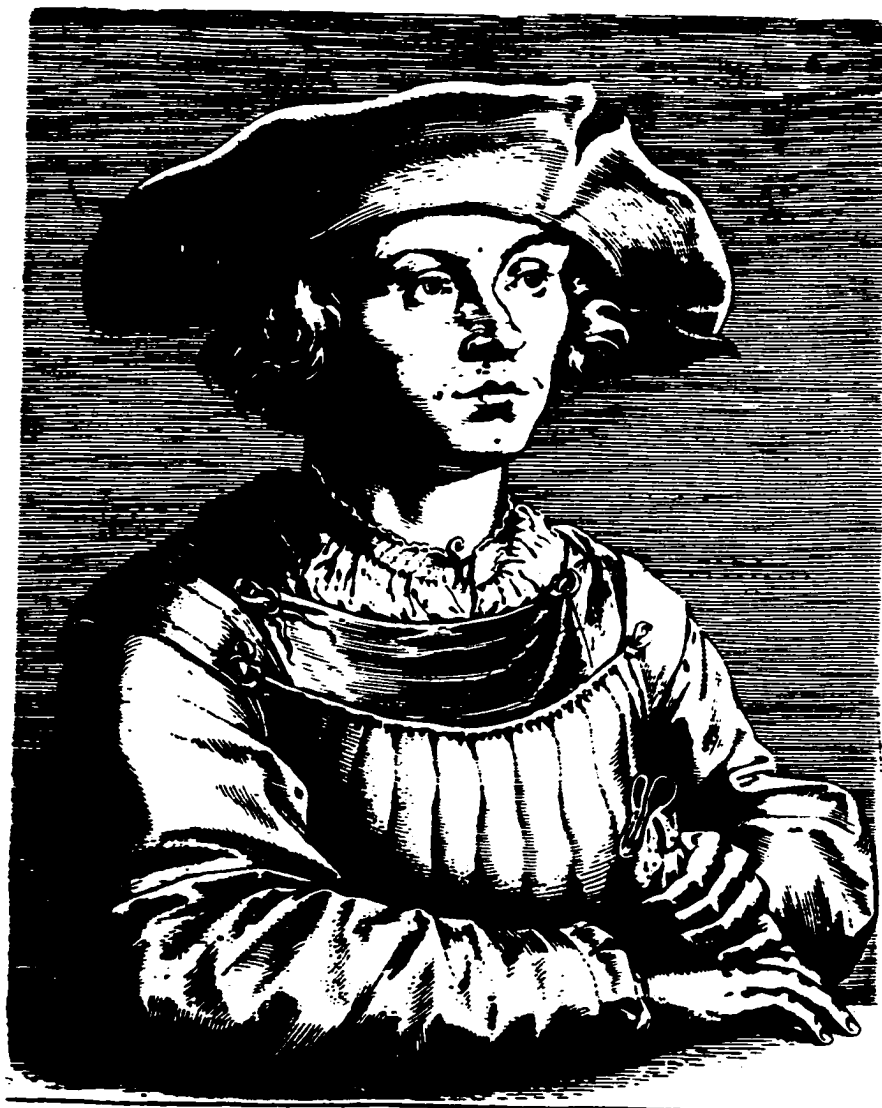
BERNARDO BRUXELLENSI PICTORE.

6a. Bernard van Orley , 1572?. Amsterdam, Rijksprentenkabinet (box of portraits no. 167, OM-ORL).