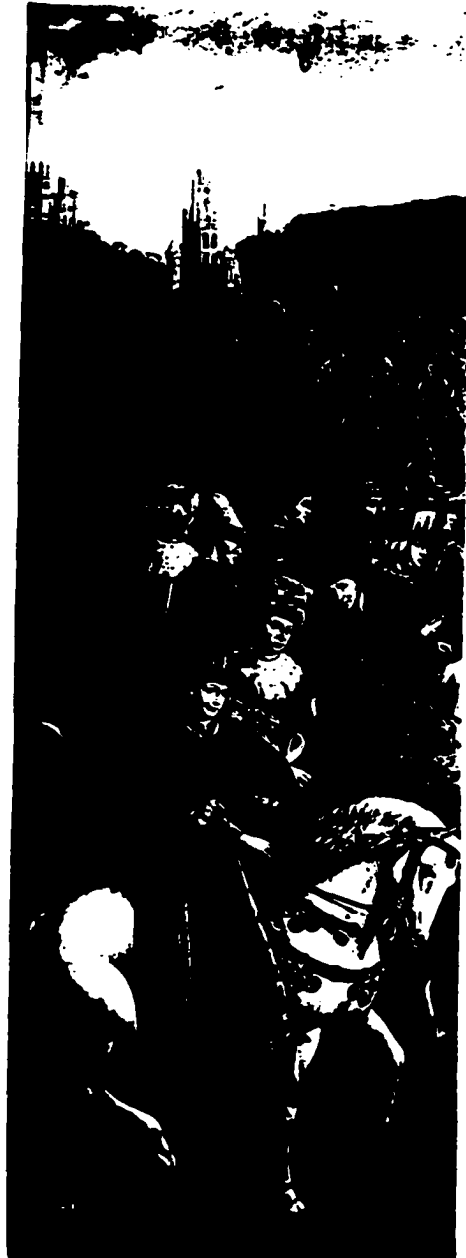
1f. Altarpiece of the Lamb, detail of the Just Judges, Hubert and Jan van Eyck 1432. Ghent, Cathedral of St. Bavo.