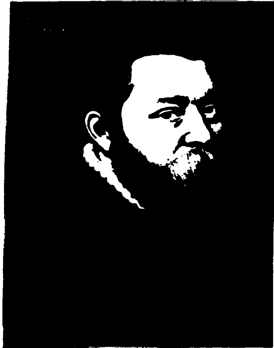
20f. Self-Portrait , Willem Key 1566. Private collection.