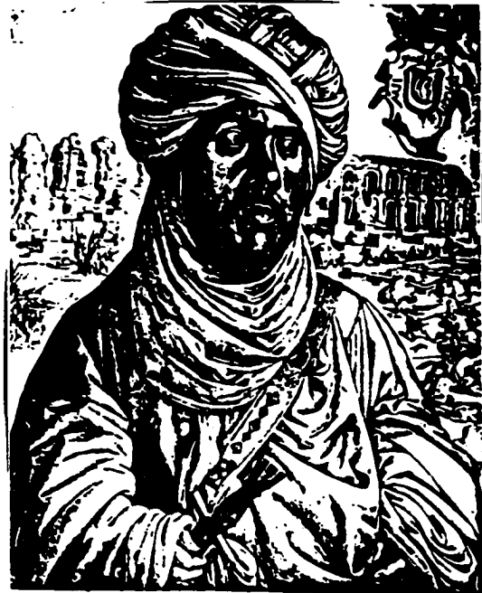
MULAY AHMET PRINCEPS AFRICANVS FILIVS RUMS VESTI