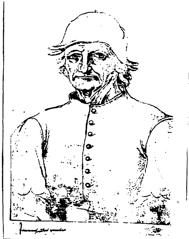
3g. Hieronymus Bosch , from the Recueil d'Arras , anonymous artist, third quarter of the sixteenth century. Arras, Bibliothèque municipale, MS 266.