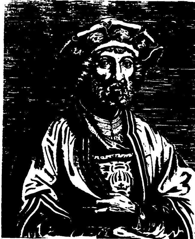
IOANNI MABVSIO, PICTORI.

Tuque adeo nostris seclum dicere, Mabusi, Versibus ad graphicen erudijisse tuum. Nam quis ad aspectum pigmenta politius alter Florida Apelleis illineret tabulis? Arte alijs, estu, tua tempora cede secutis Peniculi ductor par tibi, rarus erit.