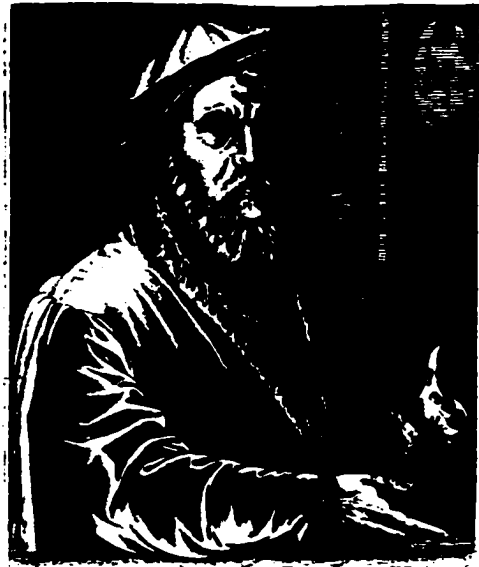
IUSTO CLIVENSI ANVERSIANO PICTORI