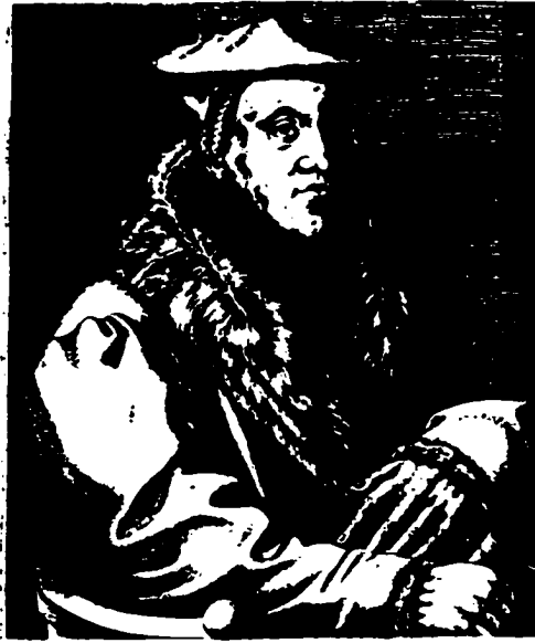
IOANNES SCORELLVS BATAVVS PICTOR.

Primus ego, egregios pictura inuisti: Romam Exemptis, aduulsi meo per, iocundis, Borgia Cunctis ferat, neque enim nulli dignamque honore Artifici, qui non gratulatus, pueri, neque, mita Cognomine, tacuit, dicit, iocundis, dignam, iocundis