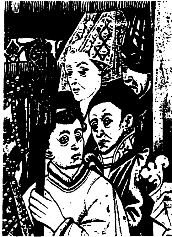
4i. Examples of Justice , detail from Herkinbald's Miraculous Absolution .