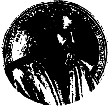
18h. Lambert Lombard , page from Album Amicorum of Otto Venius. Brussels. Koninklijke Bibliotheek.