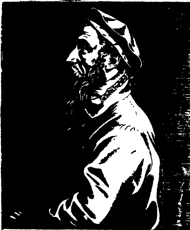
PETRO BRVEGEL, PICTORI.

Quid nouus hic Hieronymus Orbi Boschius? ingeniosa magistri Somnia peniculoque, styloque Tanta imitatrix arte peritus, Et superet tamen interim et illum?