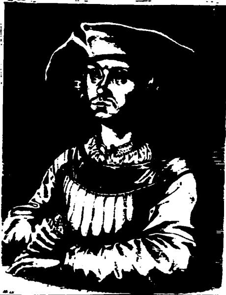
DE BERNARDO BRUXELLENSI. PICTORE.

Quisquis quos fecit Bernardus vultus alium Bruxellis. Atque dicitur deinde pueri vestes. Non tam pultoris si quis in vultu certet. Avis debetur, quamquam dicitur. Tunc Quam tunc vultus carit. Belgarum Belgarum vestes Tunc tunc Hippelica vultus est. Tunc tunc Aurea pultoris si dicitur. Tunc tunc Sape tunc vultus pultoris ante. Tunc tunc