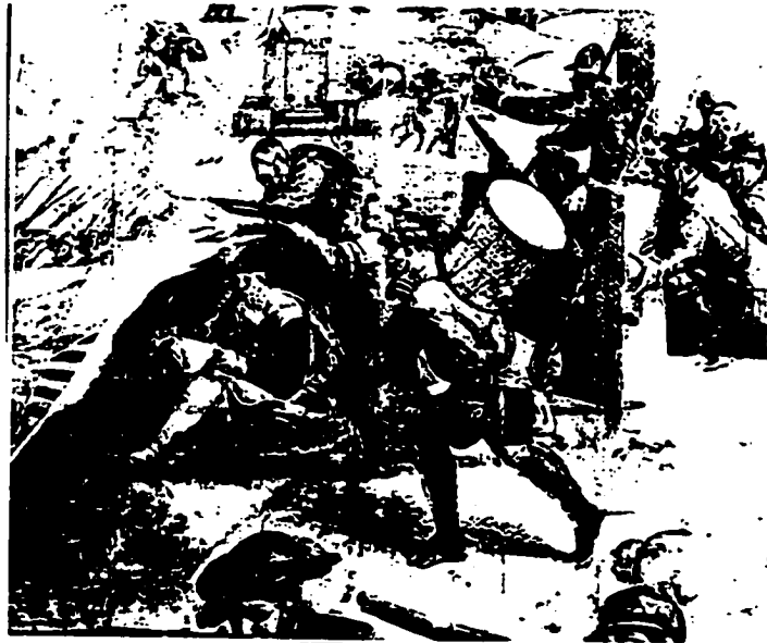
15f. Skirmishes on the Cape of Carthage , detail from cartoon for fourth tapestry in Conquest of Tunis series, Jan Cornelis Vermeyen 1546-1548. Vienna. Kunsthistorisches Museum.