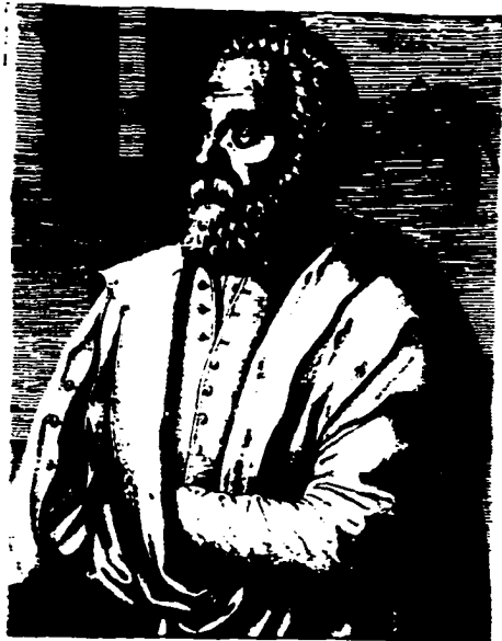
LAMBERTO LOMBARDO LEODIENSI. PICTORI ET ARCHITECTO.

Engraving ex merito quod te Lombardus, aedificat Non adest hic paucis tantum vericulis Convincet hoc ea cuncta aegri si nostris merentur De te quam fecit Anselmus 1580.