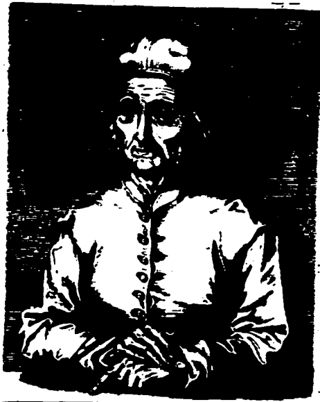
HIERONIMO BOSCHIO PICTORI.

Quid fieri vult Hieronymus Boghis Apud nos Tūm Dicit auctori Ite omnia tuae auctoritas quae Creaturam patuisse recusat Pallor in ore scilicet laetitia si Terrestriaque domas tua quoniam Spectat a Erebi roatantes corū Quaeque haec sunt omnia Auctori Tam potuit bene pingere auctori.