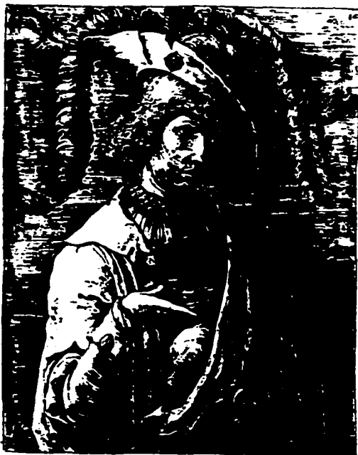
LVCAE LEIDANO, PICTORI.

Tu quoque Duxeris non per, sed prope, Lucas, Sua tabulae pingis, seu formae sculpsit abenas. Et Typo reddentes omnes miranda papyro, Haud minus in parietibus tua est, ea gloria, vestro Accede, et tecum nasci Leida. Canone.