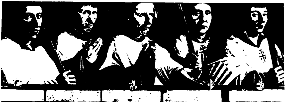
17f. Members of the Confraternity of Jerusalem at Utrecht, detail [Jan van Scorel at extreme left], Jan van Scorel 1525-1526. Haarlem, Frans Halsmuseum.

17c. Jan van Scorel, Hondius 1610. Amsterdam, Rijksprentenkabinet. inv. no. 327-I-15.