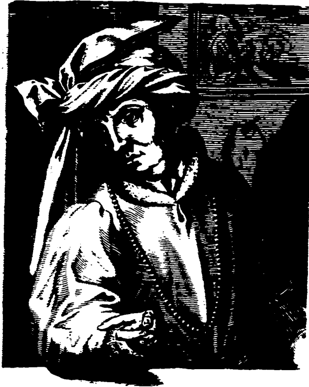
IOANNES AB EYCK. PICTOR.

Ille ego, qui latus oleo de semine iuni Expresso locum principis miscere colores. Huberto cum fratre nouum stupuere repositum. Atque ipsi unotum quondam fortassis Apelli. Florentes opibus Bruga mea nostra per omnem Diffundit iate probitas non abnuat orocem.