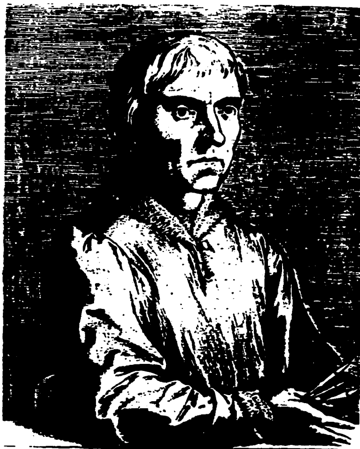
THEODORO HARLEMIO, PICTORI.

Huc Grades, Theodore, tuam quoque Belgica semper Laude nihil ficta tollet ad astra manum, Ipsa tuis rerum genitrice expressa figuris Te Natura sibi dum timet arte parent.