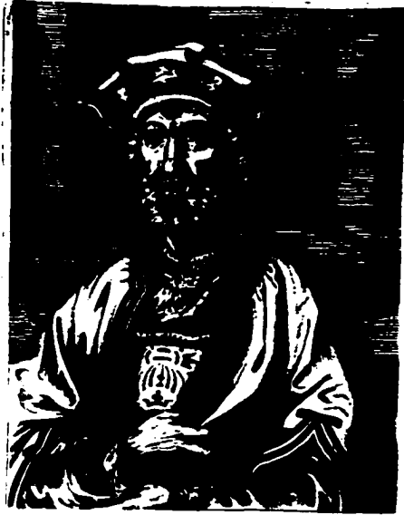
IOANNI MABVSIO. PICTORI