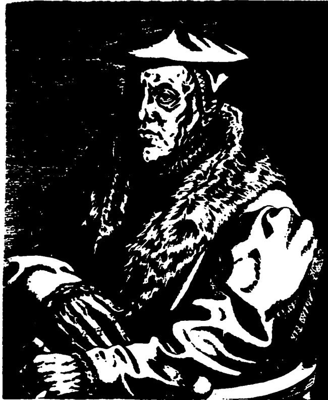
IOANNES SCORELLVS BATAVVS, PICTOR.

Primus ego egregios pictura inuisere Romam Exemplo docuisse meo per secula Belgas Cuncta ferar neque enim iusti dignandus honore Artificis, qui non graphidas, pigmentaque mille Consumpsit, tabulasque scbola depinxit in illa.