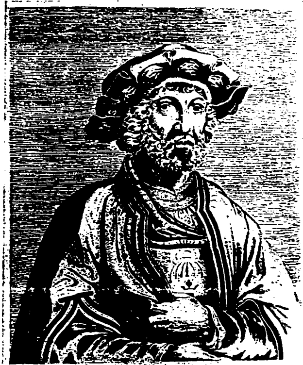
IOANNIS MABVSIO. PICTORI

Inque sacro nosse secum dicitur Macchi V'ortho: sa gratiam orasile tuam Nam qui su' aspectum p'p'monia positus aior Fioris Ap'ic'is umores caput Arce ade' este tua tempora v'bi secuti Pam. ui aitor per nos raru: ore